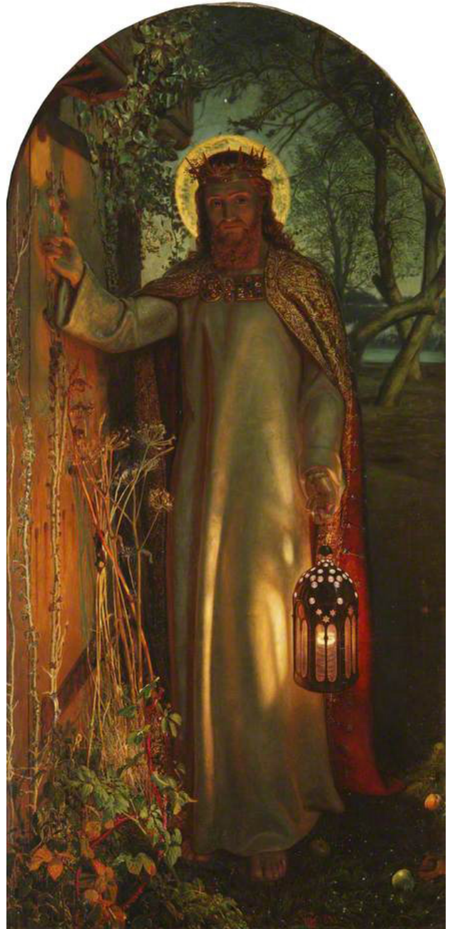
The Light of the World William Holman Hunt (1827–1910) St Paul's Cathedral