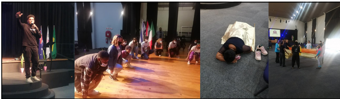
Photos from the National Conference