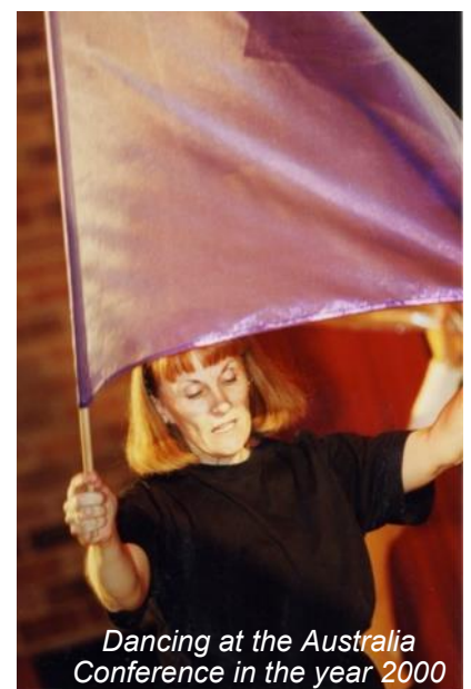
Dancing at the Australia Conference in the year 2000

We went to Australia in 2000 for the next ICDF conference, and I taught a mainstream set of four morning workshops exploring all the aspects of using flags in Praise, Worship, Warfare, Prophetic, evangelism, all age and inclusion. It was a very exciting time. The dance I taught the delegates we performed in one of the evening celebrations was 'Shout to the Lord'. It felt so amazing to be at the conference and dancing with such an enthusiastic group from many different countries - a little taste of heaven!