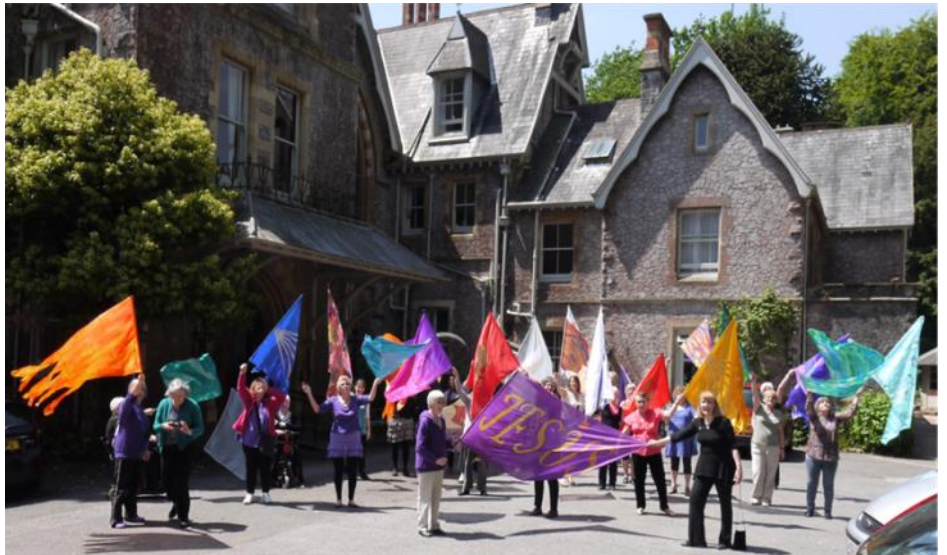
The dancers warfare with their flags outside Brunel Manor!