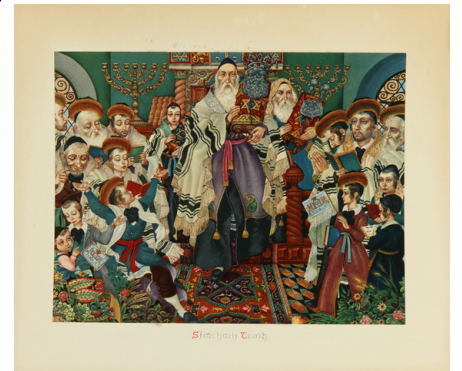
Color lithographic print of the Simchat Torah celebration, created by Arthur Szyk in New Canaan, Connecticut. The image was originally printed in the book, Six paintings of Jewish holidays, in 1948. The print depicts the male members of a Jewish congregation traditionally celebrating the religious holiday, Simchat Torah (Rejoicing with the Torah) by carrying the Torah scrolls (handwritten copy of the Torah, the five books of Moses) around the bimah (podium where the Torah and Prophets are read) and the synagogue while singing, dancing, and reciting chants.

https://www.israeltoday.co.il/read/israel-celebrates-simchat-torah-the-joy-of-gods-word/