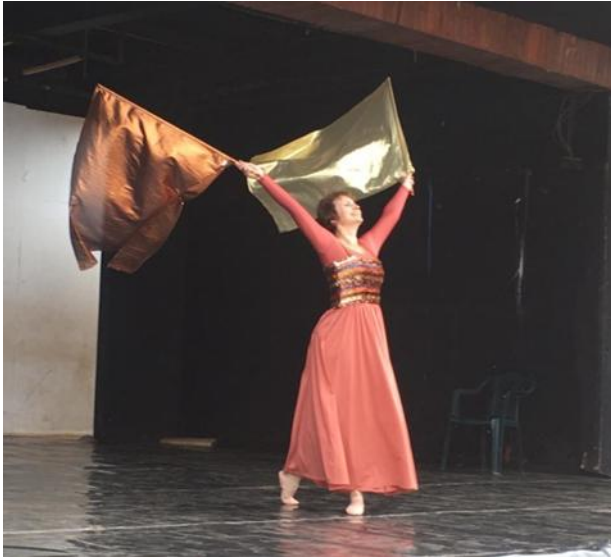
Presentation dance during morning worship