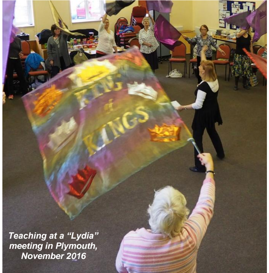
Teaching at a "Lydia" meeting in Plymouth, November 2016

I have just received an email from someone saying how blessed they have been using flags in worship and how it has brought them to a deeper place, however someone in their congregation has said the flags are a 'distraction'. My reply is to keep using the flags but to be more aware of where you are using them and also to share your testimony either in word from the front if your church has 'sharing testimony times' or to write about your experience in the church newsletter under the heading of ' My testimony of finding deeper worship '. This may help the persons who have objected to understand more!