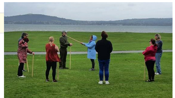
Photo: CDFI Worship Dance Picnic

The year started well for CDFI in 2020 with a day of Worship Dance in Belfast (January) and a Pamper Fundraising day (February). Once the lockdown started many planned events had to be postponed or cancelled. The highlight of the year came in September when we had an “Open Air, Social Distancing, Worship Dance” picnic by the sea at Holywood.