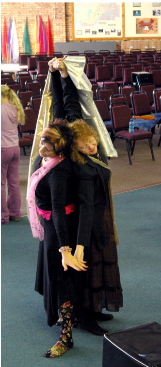
Photo: CDFSA workshop, 2008

https://www.icdf.com/en/education/icdf-diploma-or-certificate-dance-ministry