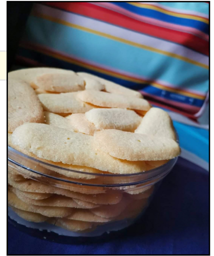
Photo: Kattetong cookies that a member sold, one of the favourite treats we enjoyed during the pandemic