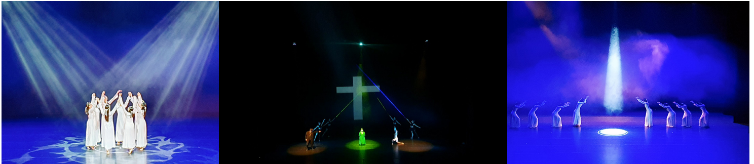
Photos: From the CDFK 20th Anniversary Concert