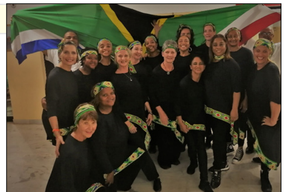
Photo: The South African team in India

A highlight was definitely the India Cultural Tour. It has bridged the gap between our international members. The country, people, culture and food...yes, I said food was amazing to experience. We ran successful, blessed workshops in our provinces and have been ministering to churches and at small and big events across South Africa. Our teams are building their committees to grow into fully functional teams with expertise from all sectors coming in.