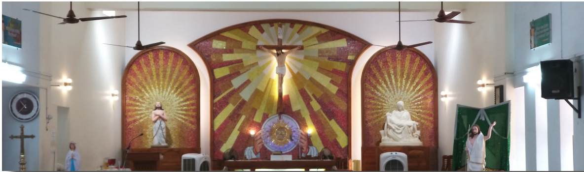
Photo: St Francis Xavier Cathedral, Tamil Nadu, India

https://www.icdf.com/sites/default/files/documents/newsflashes/icdf_newsflash_june_2019.pdf