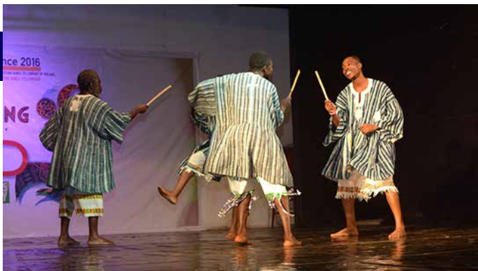
Photo: A group from Ghana doing a traditional dance at the conference