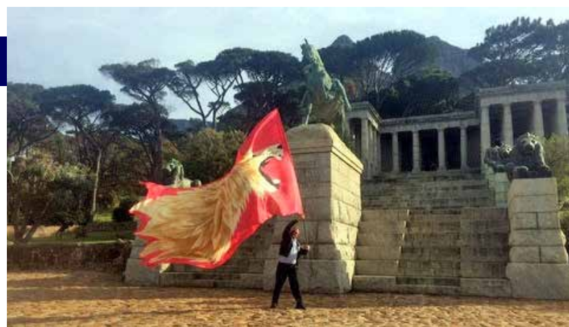
Photo: David Stanfield leading a time of ministry at the Rhodes Monument in Cape Town

CDF South Africa have also been blessed by having seven delegates at the conference in Ghana, with their dance "Africa belongs to our God" being one of the favourites.