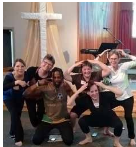
These photos were taken at some of the monthly dance workshops hosted by the CDF Calgary Chapter, Canada