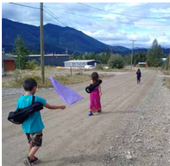
Children on the last day walking home with the ukuleles on their back carrying their flags

When the government became aware of the people living here, they started sending in planes to round up the children and take them to Residential School. Every Christmas they would return the children and leave them by the river. So one man built a cabin along the river so he could be there when his children came home. The rest of the families began to build in the same area so they became loosely connected just based on the fact they were all waiting for their children to come home. Sad thing is not all these children ever made it home. The children that did make it back are now all the elders and descendants. Even from the air one could see the depression and poverty that had gripped this village. Every house had 2 or more windows smashed in which is the result of people drinking and then throwing their bottles through the windows.