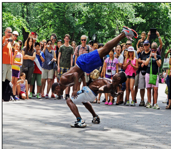
Photo: Street performers, Central Park, New York

In our last Newsflash you were invited to join us and be part of the ICDF Facebook community in this time of isolation. We are calling it "ICDF activities/movement/dance ideas to encourage us during this time of isolation" . Individuals can put together a video with an activity of their choice which ICDF members can watch and enjoy, or even join in with, wherever they are.