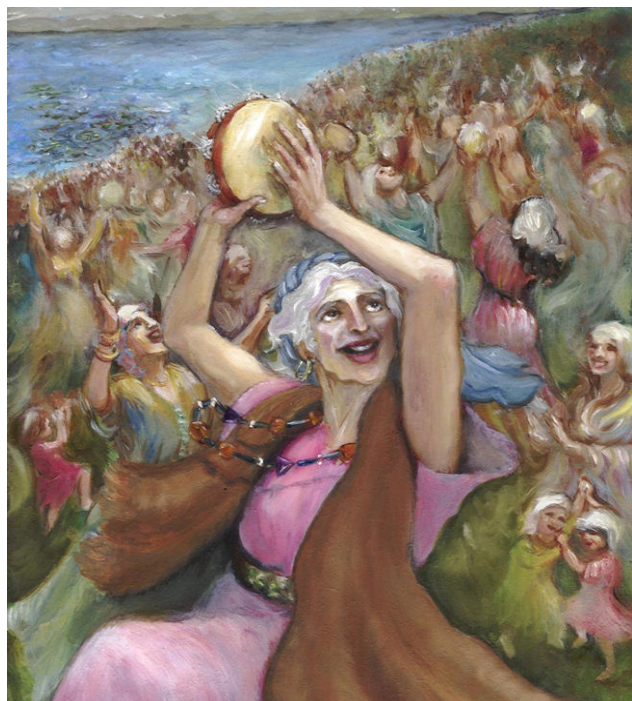
Miriam Dancing

I find it impossible to start this year's annual Messianic Dance and Tambourine newsletter without wishing all the readers health and safety in this trying time. Starting with my daughters unexpectedly quick wedding (her US Navy brother was sent to Southampton in March to teach the Royal Navy for weeks, she wanted him at the wedding). I had so many teaching presentation dance events from March to May. Dorset, Holland (ICDF Nederland), Italy, Vienna and Slovakia were booked. Needless to say all have been cancelled as I'm sure have many events of the readers!