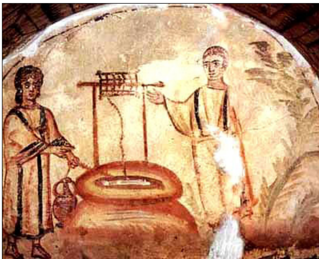
Mid-4th Century catacomb painting