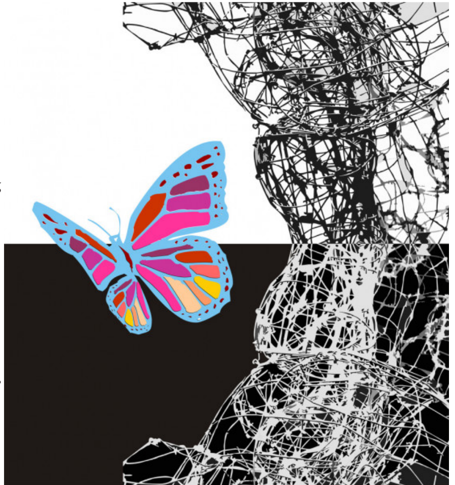
Internet illustration: Emerging Life