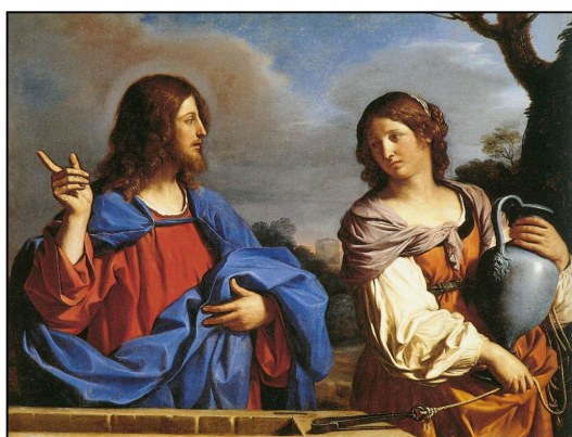
Painted by Quesrcino (1640)