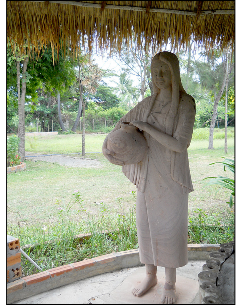
Statue from Siem Reap, Cambodia

The story takes place by a well. Those listening will (no doubt?) recall that ancestral characters like Isaac, Jacob, and Moses met their future potential brides at the side of a well just like this one. (See Genesis 24, Genesis 29, Exodus 2) Our storyteller wants to keep the wedding imagery and symbolism in play. Do not forget the earlier water, wine and wedding story. The storyteller has also just reminded them that John the baptizer referred to himself as a 'friend of the bridegroom.' However, this Samaritan woman who comes to the well is very different to those other bridal figures. She is not some virginal daughter, in the company of other women, coming at the cool of day. She is alone, and based on some of her subsequent remarks, somewhat frustrated at having to collect water in the burning heat. She is surprised when Jesus speaks to her and asks for a drink. She gets over her shock and decides to have a bit of fun at the expense of this desperately thirsty Jewish man. She proceeds with a bit of down to earth banter. When Jesus offers HER a drink, she asks Him how He hopes to provide such a drink with 'no bucket' and rhetorically asks if he is 'greater than our ancestor Jacob, who provided this well' for servants and flocks to drink from.' (John 4:12)